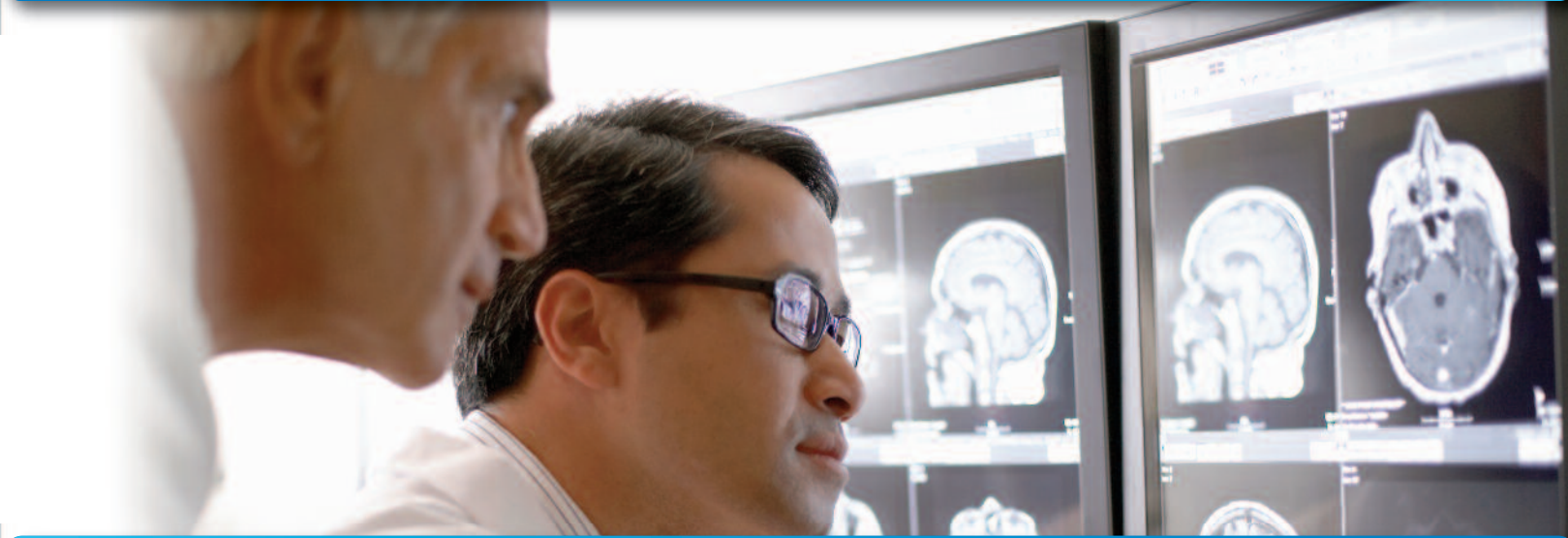
Image Systems Medical Display Bundles

As a longtime provider of display solutions for the healthcare market, Richardson has the expertise to deliver medical imaging and advanced display systems your staff needs. We specialize in creating comprehensive solutions for diagnostic and clinical review, 3-D and post processing, surgical suites and modality-specific applications. Plus, all of our solutions meet the most critical agency certifications and calibration standards for patient monitoring, bio-medical displays, ultrasound, cardiac imaging and PACS.