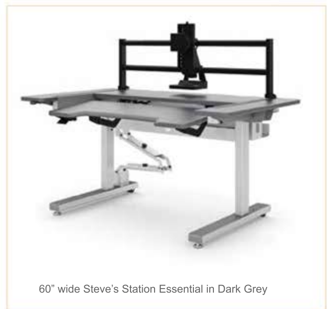
60" wide Steve's Station Essential in Dark Grey