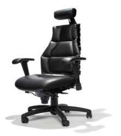
Ergonomic Seating Reduces back pain and improves productivity by promoting proper alignment.