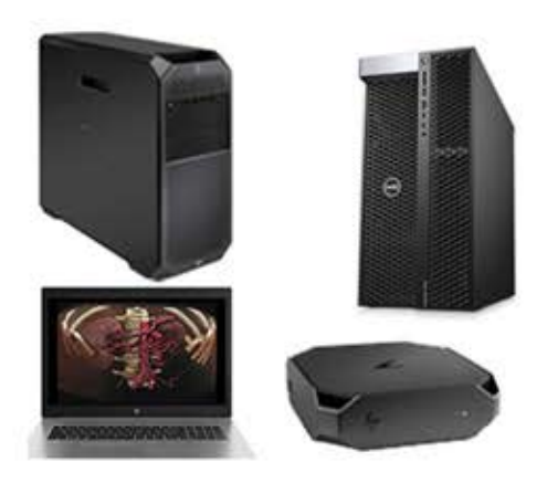
Take Advantage of our direct relationships for workstations. DBI will preconfigure all displays, graphic controllers and calibration software prior to shipment.