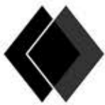
Image Systems DICOM® Calibrated Mobile Workstation Solution for Healthcare